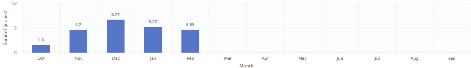
Monthly Rainfall for Current Water Year